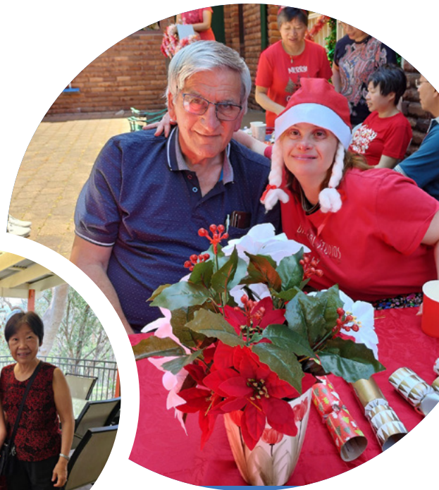
▲ ◀ Family moments and celebrations create cherished memories amidst laughter and love

46 individuals use our Support Coordination