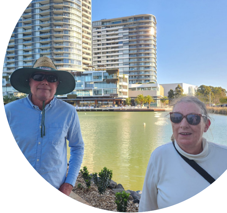
▲ Warrah residents enjoy the beauty of Sydney, one adventure at a time

Warrah's Disability Support Services provides a Supported Independent Living (SIL) program with 24/7 support for community living, with purpose-built or modified homes and Specialist Disability Accommodation (SDA) options. In-home support promotes independent living, and short-term accommodation offers a break and skill-building. The Support Coordination team assists with NDIS plans ensuring choice and control.