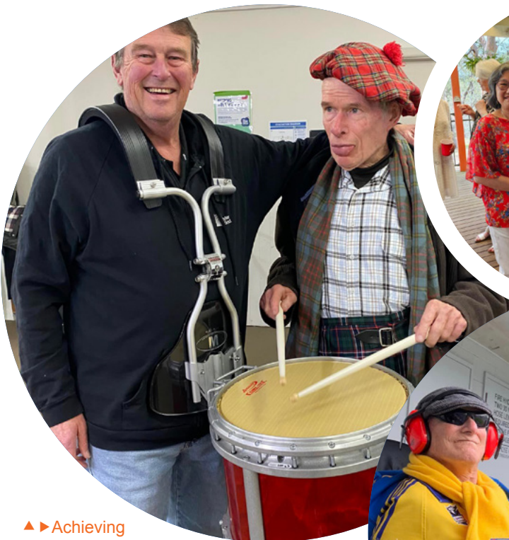
▲ ▶ Achieving goals and making new friends